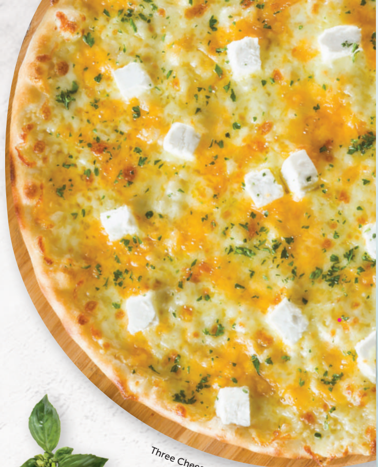
Three Cheese Flatbread