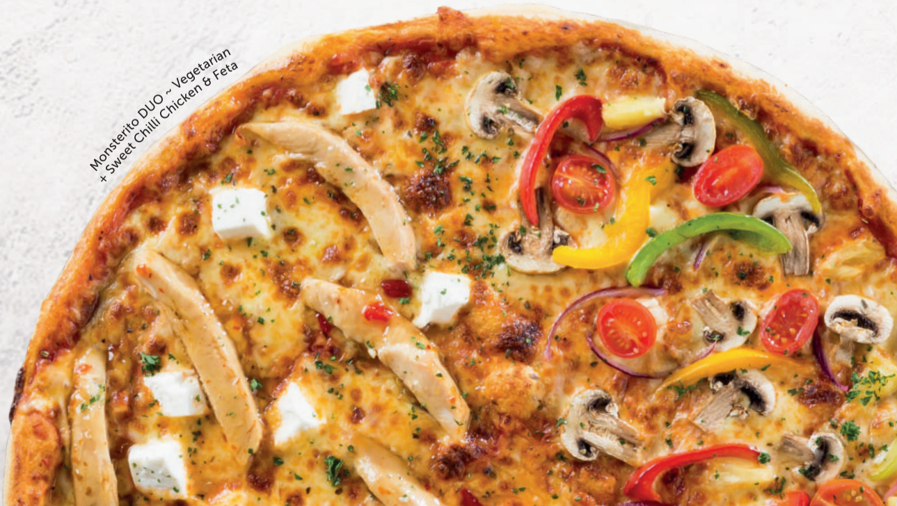
Monsterito DUO ~ Vegetarian + Sweet Chilli Chicken & Feta